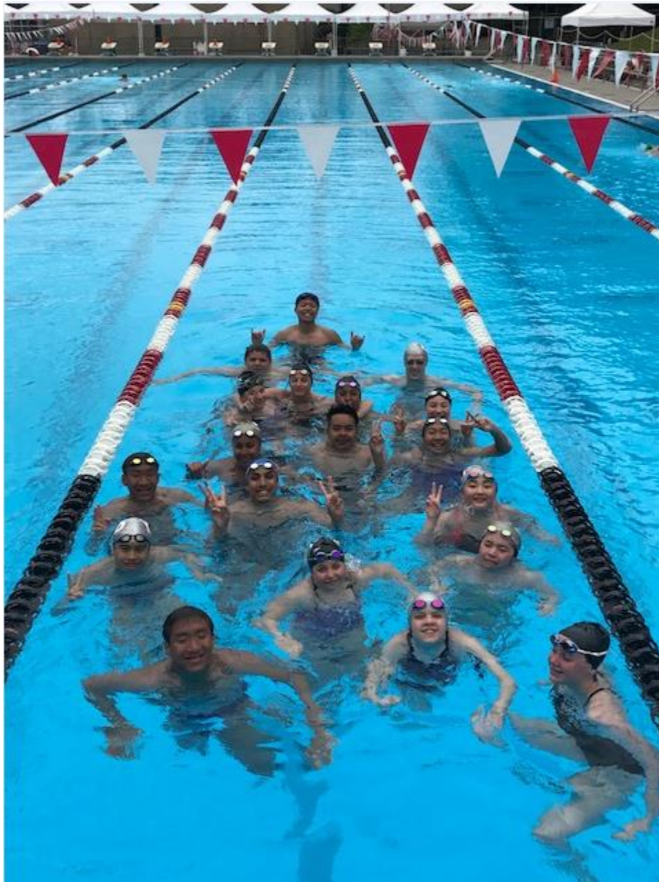
Practicing out at the MHCC long course pool