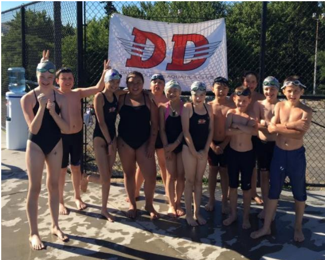
10-unders at the Dalles meet